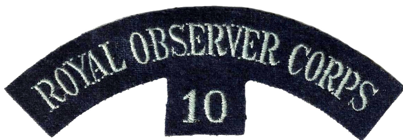
Shoulder Title (integral number 1952-53) Issued with separate numerals 1953-76 With dark blue background 1977-91