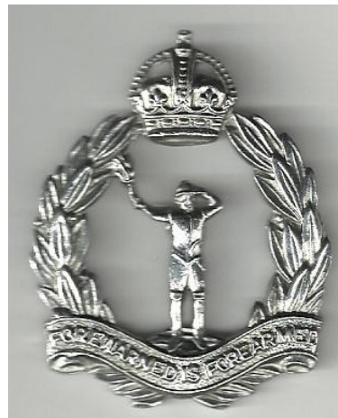
Beret Badge with King's or Queen's crown