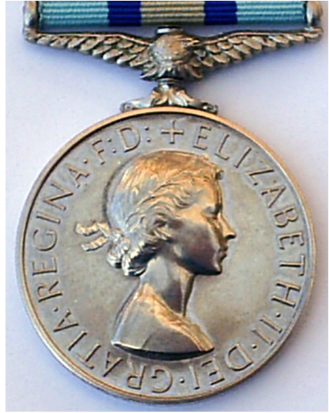
Obverse Second type 'Dei Gratia'