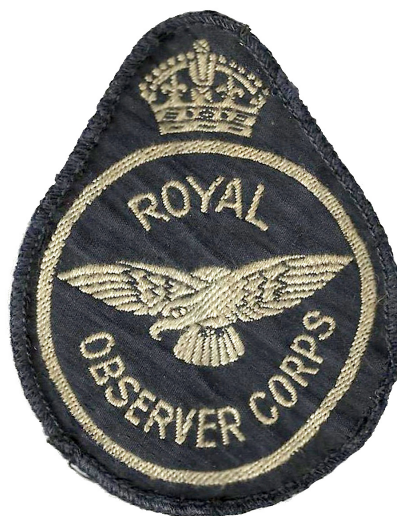
Breast Badge 1942-52