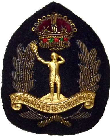
Officers' Cap Badge