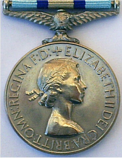
Obverse First type 'Britt Omn'