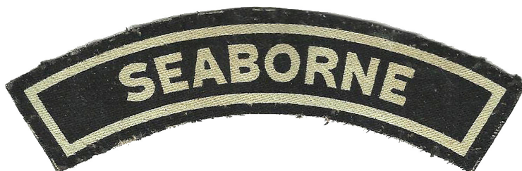
Seaborne Shoulder Title (worn by those involved in D-Day) Printed