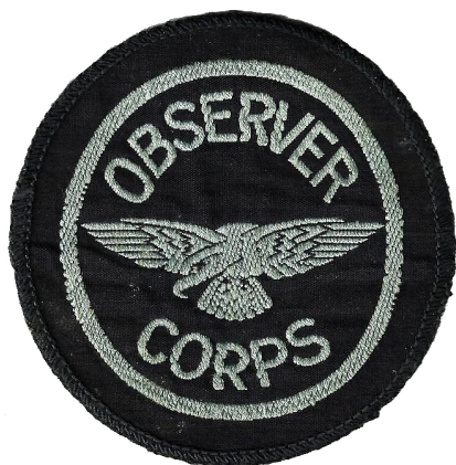
Breast Badge 1940-42