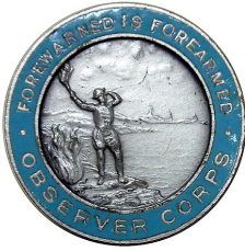
Original Lapel Badge with 'Observer Corps' title